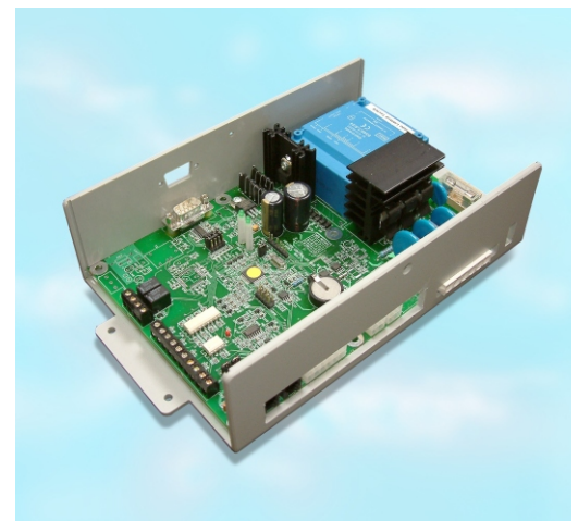
The Enetec controller with cover removed.

All Envirotec door curtains can be fitted with the Enetec controller, with the operating costs reduced in all cases.