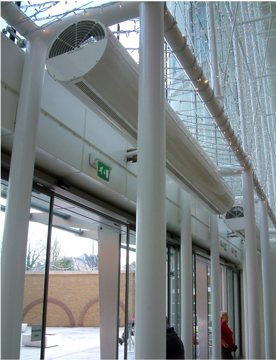
Envirotec Circular Door Curtains installed above a high-spec entrance.

Envirotec intelligent controllers significantly reduce the operating cost of door curtains